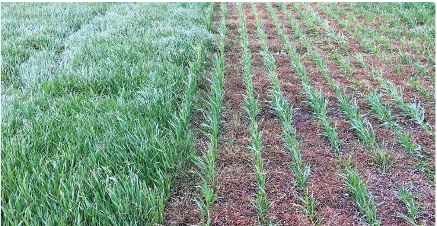
Left: UNTREATED downy brome grass population. Right: Aggressor AX @ 8 oz/acre applied. Downy brome grass is choking out the stand of wheat in the untreated check.

Call 1-855-DO RIGHT to anonymously report suspected seed IP violations or illegal use of herbicides on CoAXium wheat. ProtectCoAXium.com