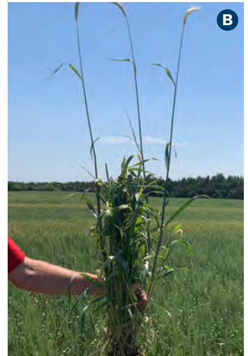
A Aggressor AX herbicide applied at 8 oz/acre + NIS at 1 QT/100 gallons in the fall of the year followed by Aggressor AX herbicide applied at 8 oz/acre + MSO at 4 QT/100 gallons.